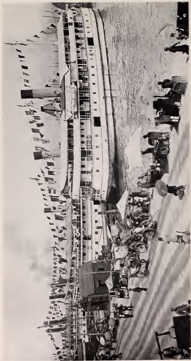
The steam river-boats at Hongkong contrast pleasantly with the jinrickshas on the quay